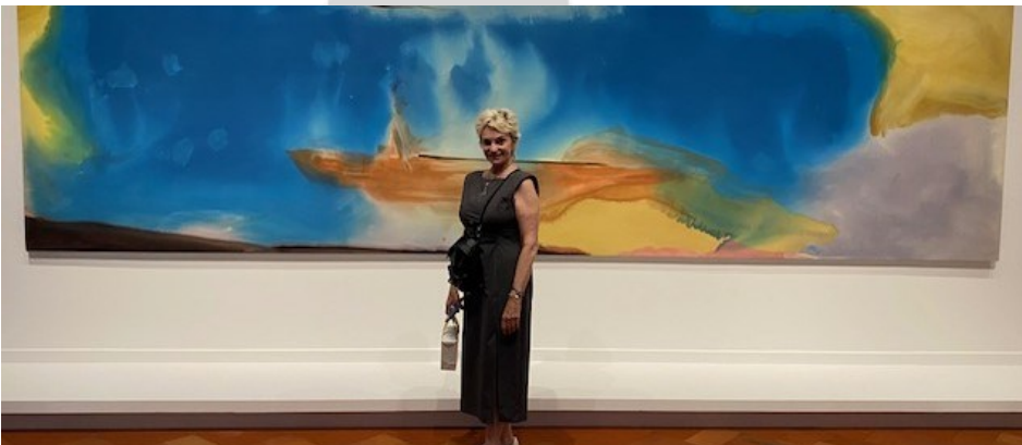
HELEN FRANKENTHALER: Painting Without Rules until 26 January 2025